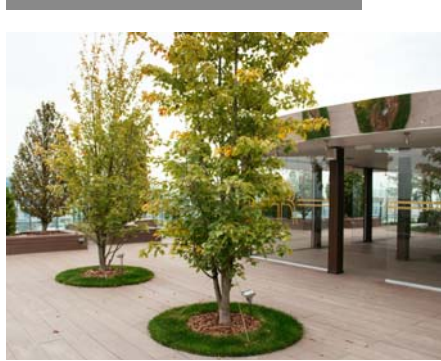
Outdoor recreation is possible within the city on the 32<sup>nd</sup> floor.