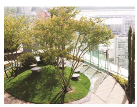
Incredible view over the central part of Kiev.

Roof construction with root resistant waterproofing