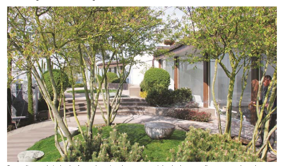
Depending on their depth of growth, various lawns, perennials, shrubs or small trees were planted.