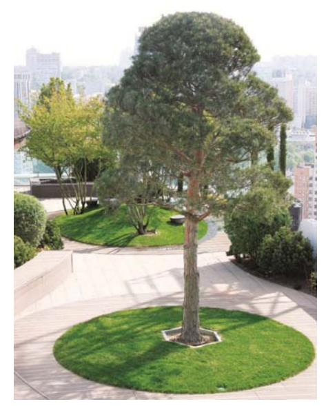
The garden centrepiece, a pine over 7 m tall and weighing 5 t.